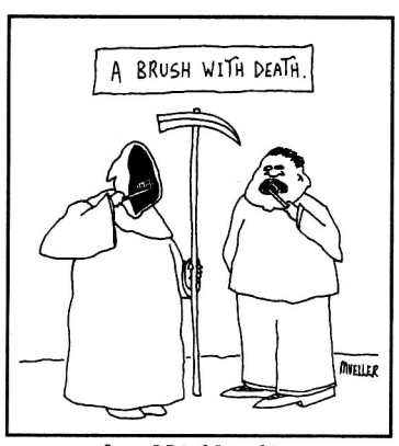
from I Died Laughing

Mother-in-law on the phone: "I've decided I want to be cremated."