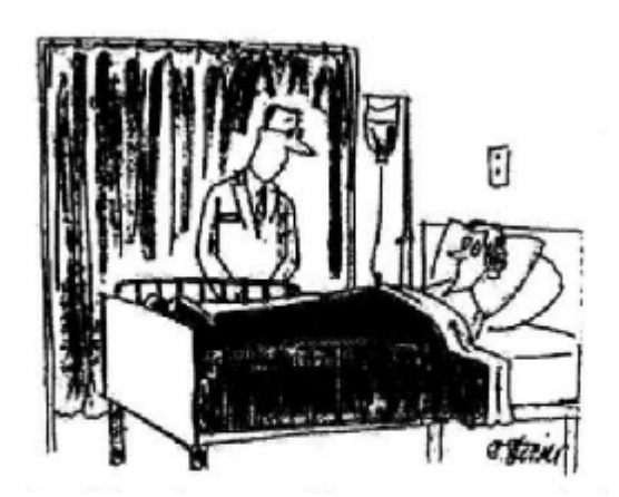
Medical ethics do not allow me to assist in your death. I am, however, permitted to keep you miserable as long as possible.